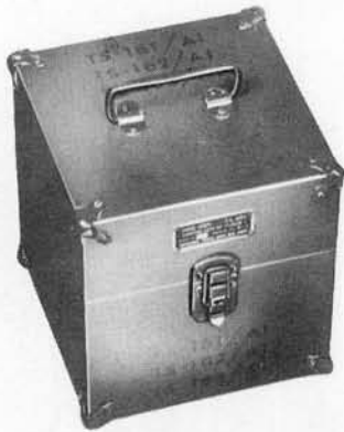
Carrying Case CY-112/AIM-1