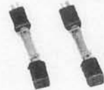
Test Rod M-143/AI