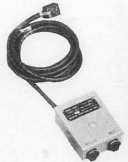
Test Set TS-163/AI